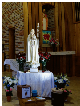
Heaven's Peace Plan