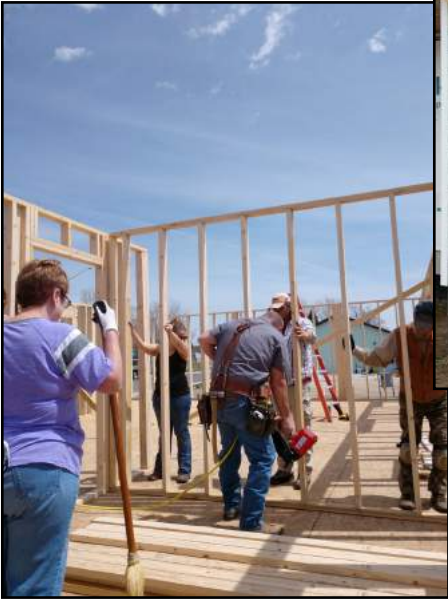
Framing and Siding are up!