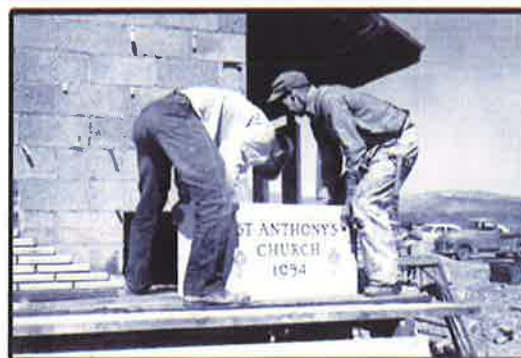
Saint Anthony of Padua through the years.