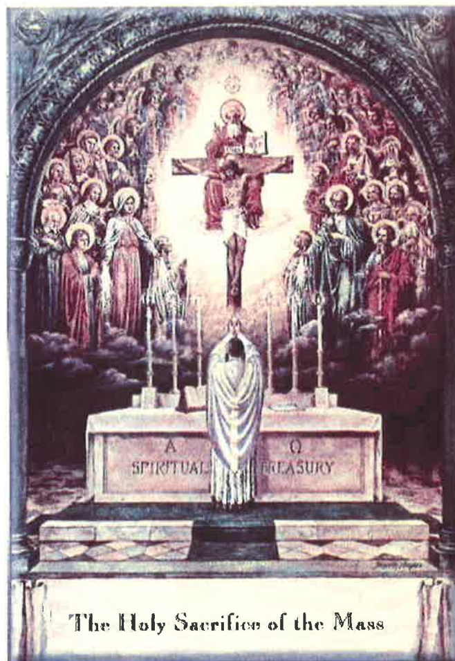
The Holy Sacrifice of the Mass

"God is everywhere." Yet, He is truly and physically present in the Eucharist. Our loved ones, being