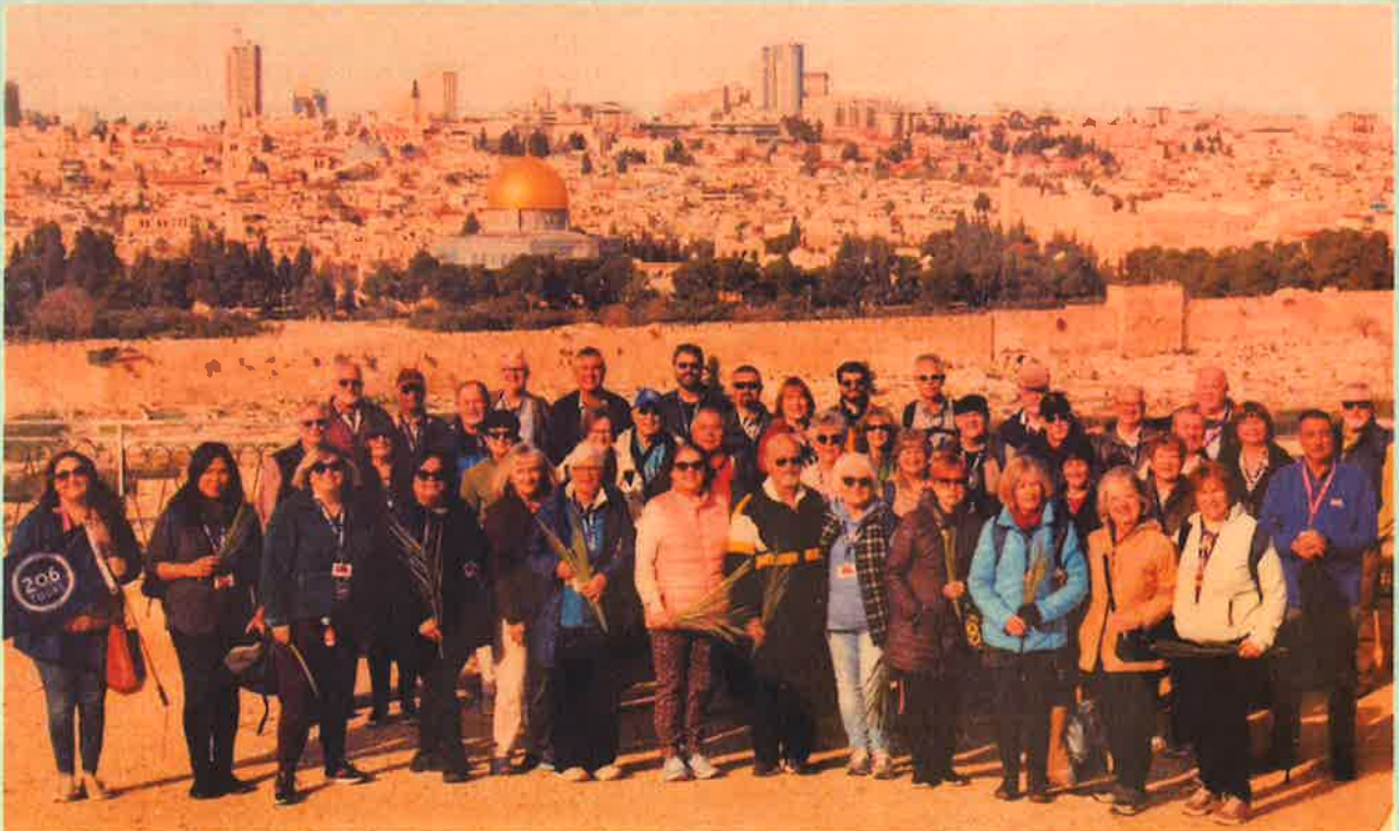
206 Tour - God's Embrace