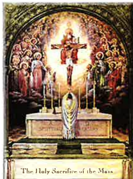
The Holy Sacrifice of the Mass