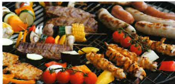
BBQ & POTLUCK