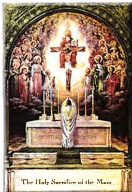
The Holy Sacrifice of the Mass

Join us for a Lively Class and Discussion of the Catholic Faith. We discuss how God, Life, Religion and History are all interconnected. Our discussions will cover what we believe, what we think and what we do.